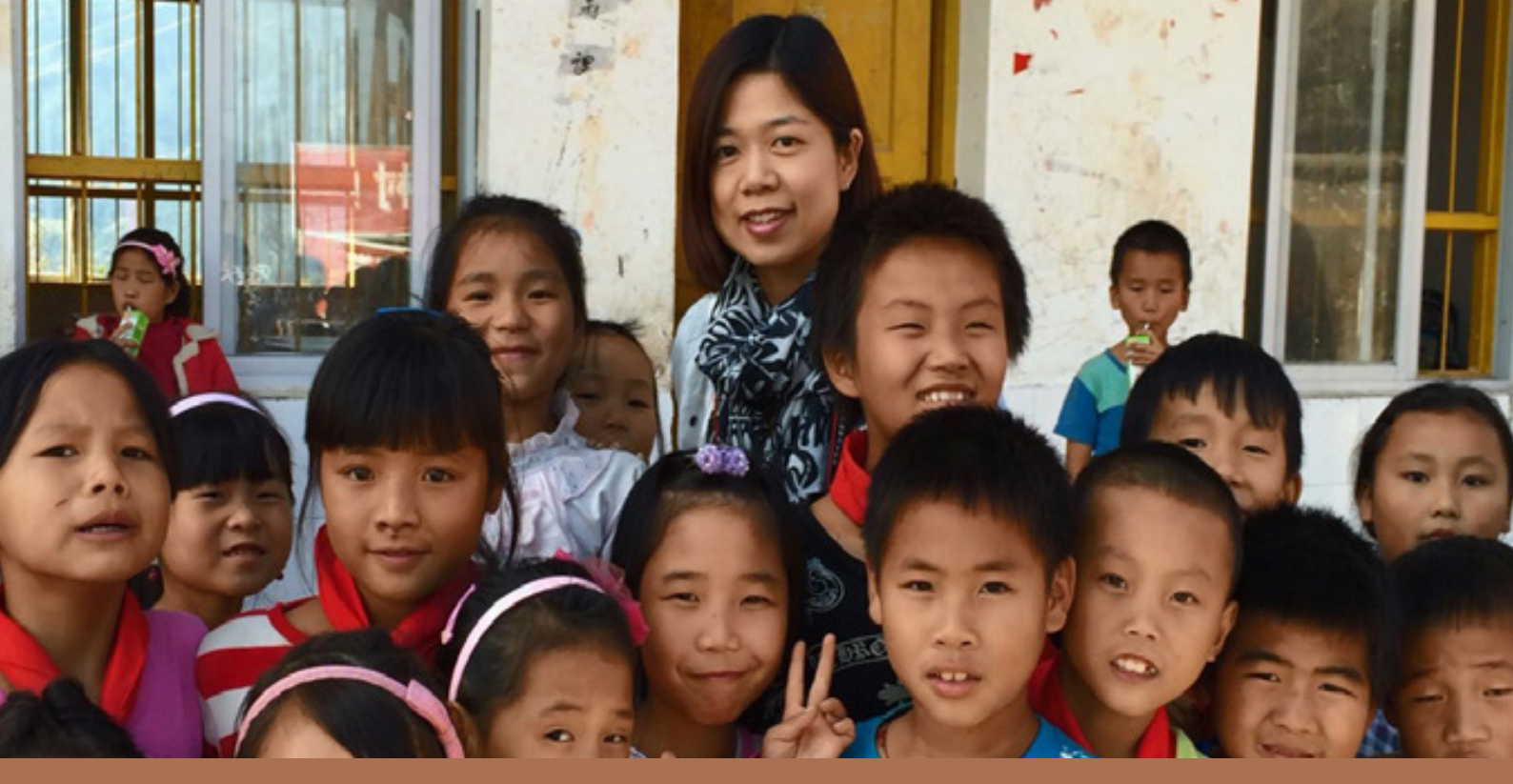
For over 10 years Mazars China has been providing pro-bono accounting services to Couleurs de Chine.